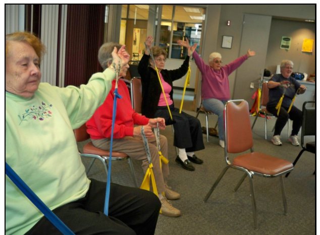
Strong for Life celebrates its 11th class located at Newberg Friends Church January 2010

Reaching out to others, even in the simplest ways, can make a tremendous difference for all of us. As Dr. Martin Luther King Jr. said, "Make a career of humanity...and you will make a greater person of yourself, a greater nation of your country and a finer world to live in." Everyday our volunteers reach out to older adults and children with disabilities in our community. Did you know that in 2009, an average of 104 volunteers participated in at least one of our three programs per month? Volunteers reached out to 319 of our recipients throughout the year! Between helping recipients and assisting in our office, our volunteers donated 5,337 hours. Today is an excellent day to start planning what you'll do in the year ahead to connect with others and make a difference.